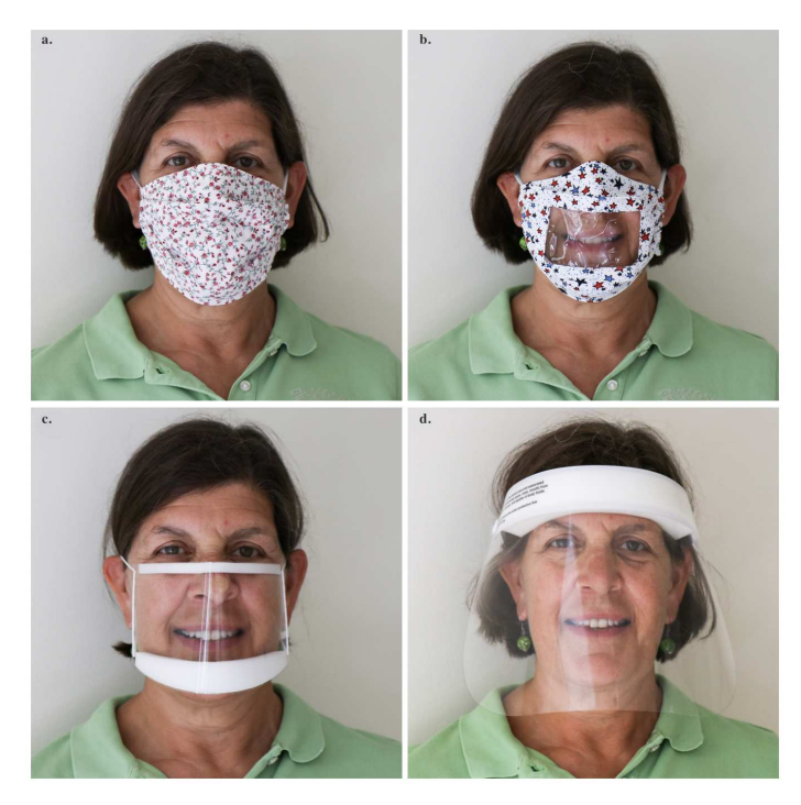
Figure 1. Four variations of face coverings investigated both with and without remote microphone technology. These variations were selected based on commercial availability and likelihood of use in classroom settings.

Participants in this study included 15 adults with hearing thresholds in the normal range (25 dB HL or better) across octave frequencies of 250 – 8000 Hz in each ear, as evaluated in a sound-treated booth at the Moog Center on the day of the speech perception testing. Speech perception assessment was conducted in an unoccupied classroom at the Moog Center using the Consonant/Nucleus/Consonant (CNC) Test (Peterson & Lehiste, 1962). This assessment contains 50 monosyllabic words (e.g., merge, seize, yearn, etc.) which exhibit phonemic distributions proportional to the structure of CNC words which occur with minimal frequencies of one per million in agreement with the Thorndike and Lorge frequency count (Thorndike & Lorge, 1944).